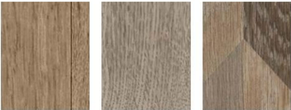
Alden Oak 3402 LRV 25 200 x 1900mm Marlborough Oak 3404 LRV 24 200 x 1900mm Tan Bowman Oak 3409 LRV 23 100 x 333mm