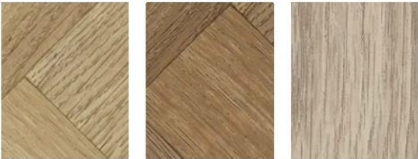
Oxford Basket Weave 3407 LRV 31 56 x 297mm & 120 x 120mm Warwick Basket Weave 3408 LRV 16 56 x 297mm & 120 x 120mm Lake House Oak 3403 LRV 33 200 x 1900mm