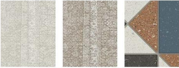
Fresh Persian Loom 3412 LRV 05 330 x 330mm Rich Persian Loom 3413 LRV 41 330 x 330mm Parlour Tile 3414 LRV 26 *