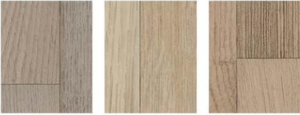
Dorchester Oak 3406 LRV 30 200 x 1900mm Rose Hill Oak 3401 LRV 38 200 x 1900mm Bowery Oak 3405 LRV 32 200 x 1900mm