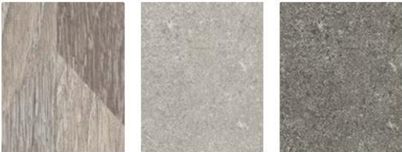
Grey Bowman Oak 3411 LRV 25 100 x 333mm Portland Cement 3416 LRV 40 Hudson Cement 3417 LRV 20