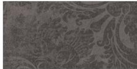
Onyx Ornamental 9862 NCS S 1000-N