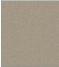
Moleskin 9841 NCS S 3003-Y20R