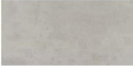
Light Grey Concrete 9858 NCS S 3000-N