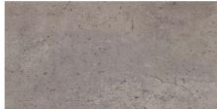
Dark Industrial Concrete 9859 NCS S 4502-R