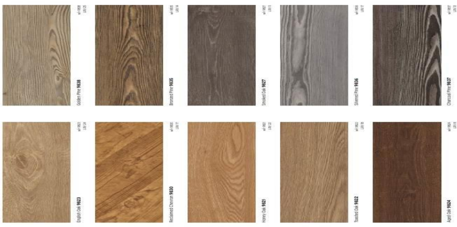
English Oak 9823 w/ 9823 187.23 Golden Pine 9828 w/ 9828 187.28 Reclaimed Charcoal 9820 w/ 9820 187.20 Reclaimed Oak 9821 w/ 9821 187.21 Reclaimed Pine 9825 w/ 9825 187.25 Shaded Oak 9827 w/ 9827 187.27 Shaded Pine 9826 w/ 9826 187.26 Charcoal Pine 9827 w/ 9827 187.27 Apex Oak 9824 w/ 9824 187.24

9820, 9821, 9823, 9824, 9825, 9826, 9827, 9828 100% Recycled Material