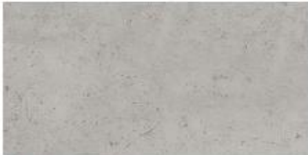
Light Industrial Concrete 9860 NCS S 2500-N