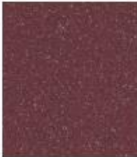
Plum 9847 NCS S 6020-R30B