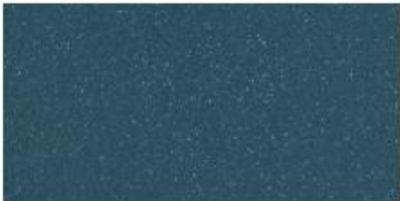
Steel Blue 9852 NCS S 6020-B3G