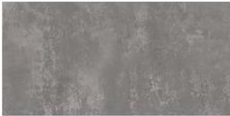
Cool Concrete 9856 NCS S 4500-N