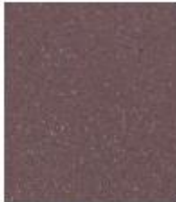
Mulberry 9846 NCS S 6010-R30B