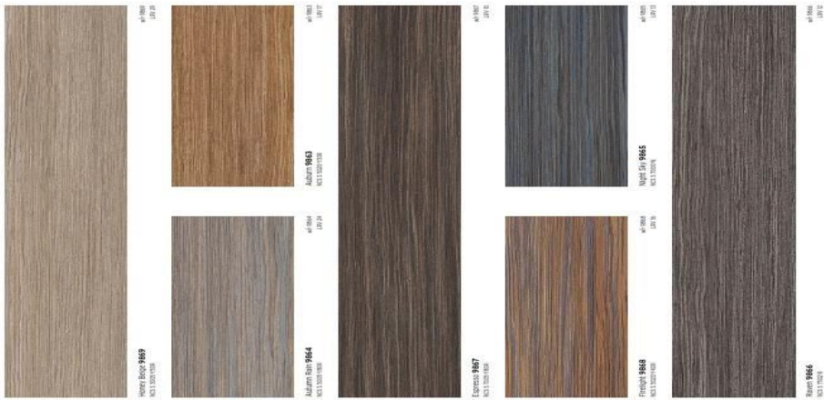
Henry Rope 9859 w/ 9859 187.20 Alamo Oak 9864 w/ 9864 187.24 Admiral Oak 9863 w/ 9863 187.23 Express 9867 w/ 9867 187.17 Forest 9868 w/ 9868 187.18 Forest Oak 9865 w/ 9865 187.15 Forest Pine 9866 w/ 9866 187.16