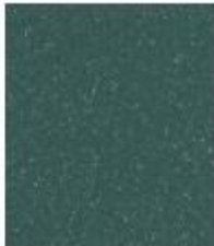
Woodland 9853 NCS S 6020-B50G