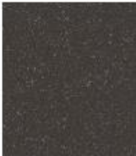
Jet 9842 NCS S 8020-N