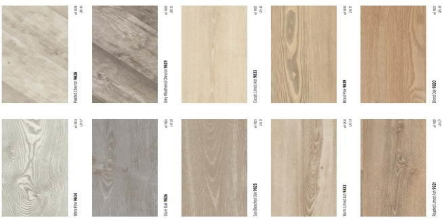
White Pine 9834 w/ 9834 187.34 Painted Charcoal 9829 w/ 9829 187.29 Grey Washed Charcoal 9829 w/ 9829 187.29 Classic Limited Oak 9833 w/ 9833 187.33 Broad Pine 9839 w/ 9839 187.39 Broad Oak 9820 w/ 9820 187.20 Silver Oak 9826 w/ 9826 187.26 San Blas Oak 9825 w/ 9825 187.25 Warm Limited Oak 9832 w/ 9832 187.32 Reclaimed Limited Oak 9821 w/ 9821 187.21