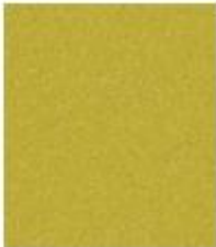
Meadow 9850 NCS S 2050-G90Y