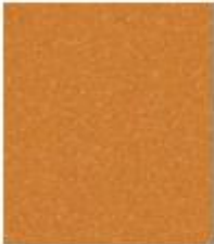
Burnt Orange 9848 NCS S 3040-Y40R