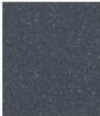
Midnight 9854 NCS S 7003-B90B