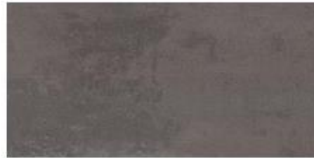
Dark Grey Concrete 9857 NCS S 0502-R