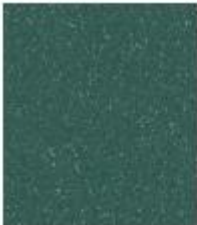
Teal 9851 NCS S 6020-B70G