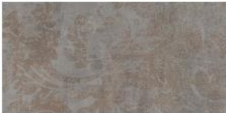
Copper Ornamental 9861 NCS S 0502-R