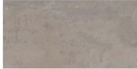
Warm Concrete 9855 NCS S 3502-R